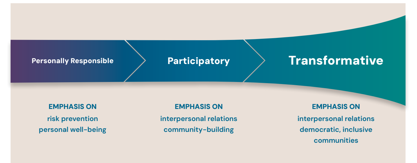
Figure 3. Continuum of Transformation

A transformative approach to SEL is not confined to a single person, lesson, or specific time of the day and is not a one-size fits all program or curriculum. Instead, it is an ongoing process and practice of how adults and students show up for one another in moments throughout the school day. SEL practices exist on a continuum, moving from personally responsible and participatory SEL to a Transformative SEL approach (Figure 3). Transformative SEL was developed to shift the focus of educators away from behavior management and toward creating the conditions that support respectful, dignifying, and affirming interactions among all students and adults along the continuum of transformation. Once conditions for learning and thriving are put in place, students can learn to set goals, manage their own behaviors, and ultimately participate, improve, and change institutions and systems in ways that promote equitable outcomes (Jagers et al., 2019). When Transformative SEL is embedded throughout the day, it has the potential to humanize the learning environment by honoring students' and adults' lived realities of race, class, culture, and other intersectional identities.