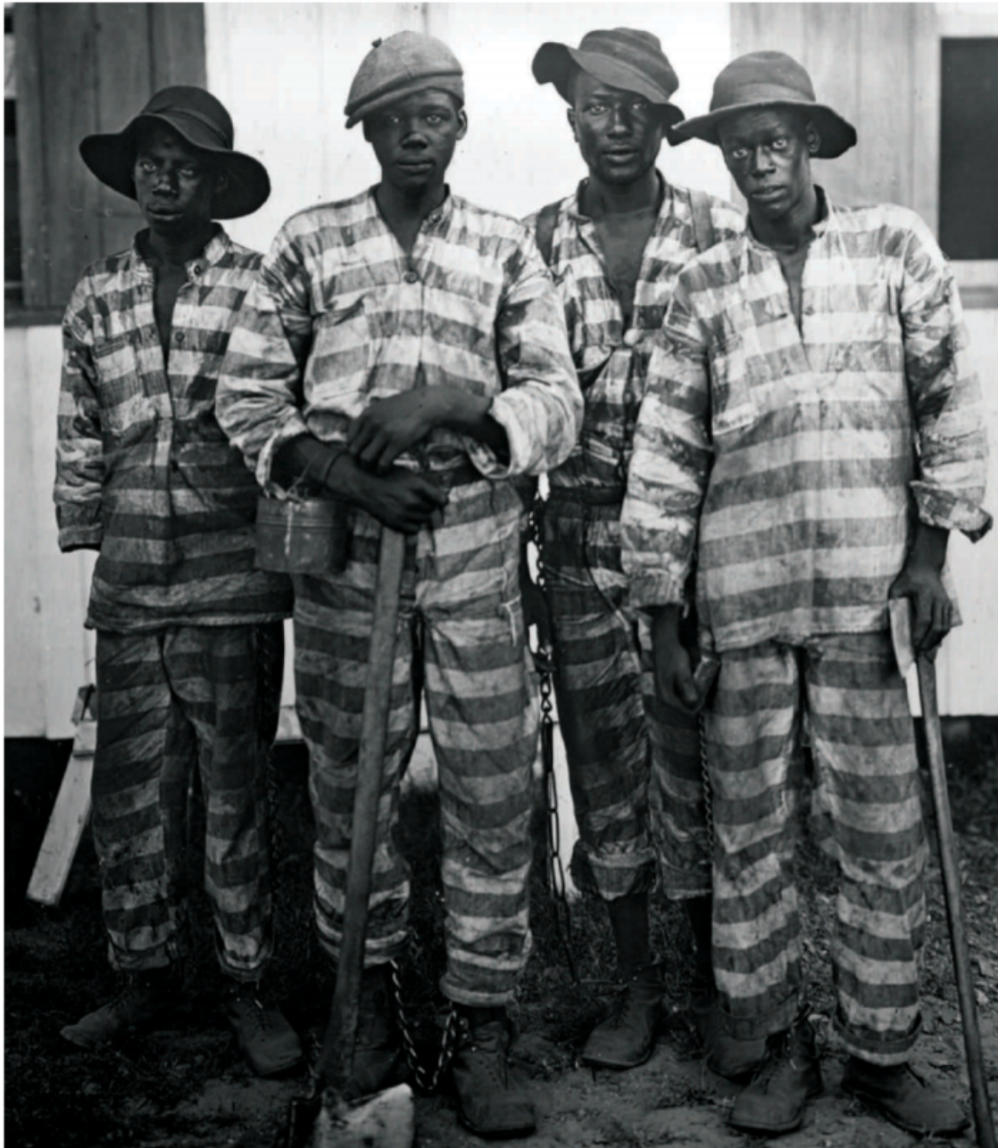
Convict leasing re-enslaved thousands of African Americans by using selectively enforced criminal codes to convict and then lease black people to businesses for dangerous slave labor.