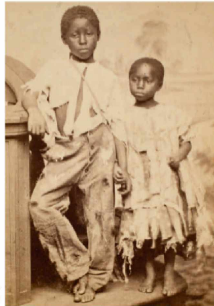
Many enslaved and orphaned children were abandoned during the turmoil of the Civil War.

American slavery began as such a system. When the first Africans were brought to the British colonies in 1619 on a ship that docked in Jamestown, Virginia, they held the legal status of “servant.” 11 But as the region’s economic system became increasingly dependent on forced labor, and as racial prejudice became more ingrained in the social culture, the institution of American slavery developed as a permanent, hereditary status centrally tied to race. 12