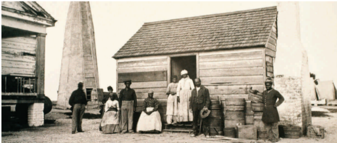
Enslaved people had to fear brutal abuse and mistreatment on many plantations in the South.

In the decades leading up to the Civil War, confronted with abolitionists’ moral outrage and growing political pressure, Southern slaveowners defended slavery as a benevolent system that benefitted enslaved black people. 16 Even today, some continue to echo those claims in attempts to justify more than two centuries of human bondage, forced labor, and abuse. 17 Records from the era paint a much different picture, revealing American slavery as a system that was always dehumanizing and barbaric, and often bloody, brutal, and violent.