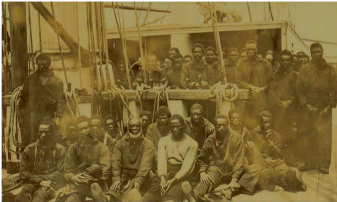
"Contrabands" were enslaved people who escaped from plantations and sought protection from Union forces during the Civil War. These men escaped from plantations in South Carolina in 1862.

"[T]he institution of slavery, per se, is as justifiable as the relation of husband and wife, parent and child, or any other civil institution of the State, and is most necessary to the well-being of the negro, being the only form of government or pupilage which can raise him from barbarism, or make him useful to himself or others; and I have no doubt but that the institution, thus far in our country, has resulted in the happiness and elevation of both races; that is, the negro and the white man. In no period of the world's history have three millions of the negro race been so elevated in the scale of being, or so much civilized or Christianized, as those in the United States, as slaves. They are better clothed, better fed, better housed, and more cared for in sickness and in health, than has ever fallen to the lot of any similar number of the negro race in any age or nation; and as a Christian people, I feel that it is the duty of the South to keep them in their present position, at any cost and at every peril, even independently of the questions of interest and security." 14