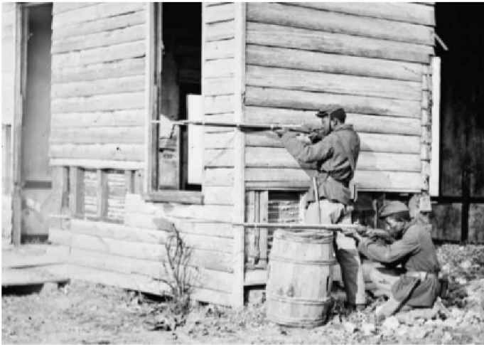
Many African Americans fled plantations to fight with the Union Army.

Racial violence targeting newly freed black people persisted during Reconstruction and ultimately outlasted the post-war federal intervention in the Southern states. Reconstruction ended less than fifteen years after the war's end, leaving the vast majority of the nation's black population still residing in the South, vulnerable to systems and institutions controlled by the very white people who had recently enslaved them and who largely still believed black people were inferior. A contemporary observer described the feelings of Southerners in the period immediately following the war: