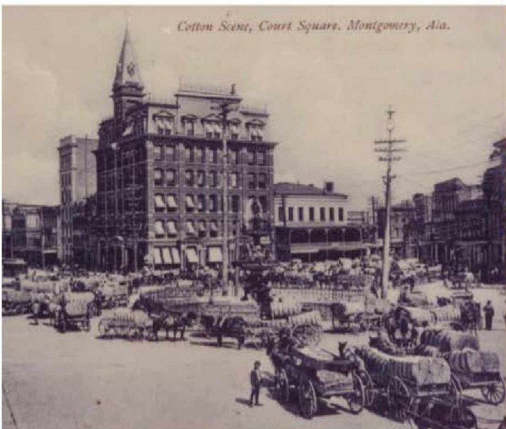
Cotton Scene, Court Square, Montgomery, Ala.

"[Where] two principal streets met and formed an obtuse angle and another street crossed, there was sufficient space for a public market-place in the business center of the little city. From there a part of Market street (now Dexter avenue) ran up the capitol, on a commanding site about three-fourths of a mile to the east, and the other part (now Commerce street) ran down to the railroad and the Alabama River, about half as far to the northwest. The best hotel, the Exchange, faced this market-place, and most of the public buildings, banks and churches were near." 74