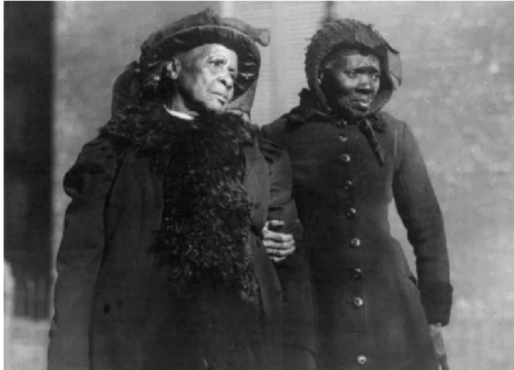
Two women attend a convention for formerly enslaved people in Washington, D.C., in 1916.

At post-Civil War conventions for formerly enslaved people, formerly enslaved women reported that they had been sexually abused while they were enslaved.