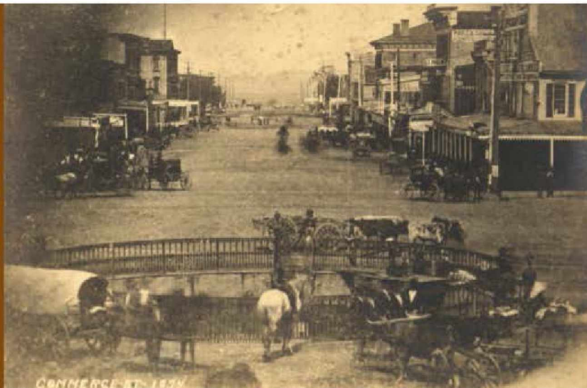
Court Square in downtown Montgomery, Alabama, looking down Commerce Street.

During the last twenty years of American slavery, no slave market was more central or conspicuous than the one in Montgomery, Alabama.