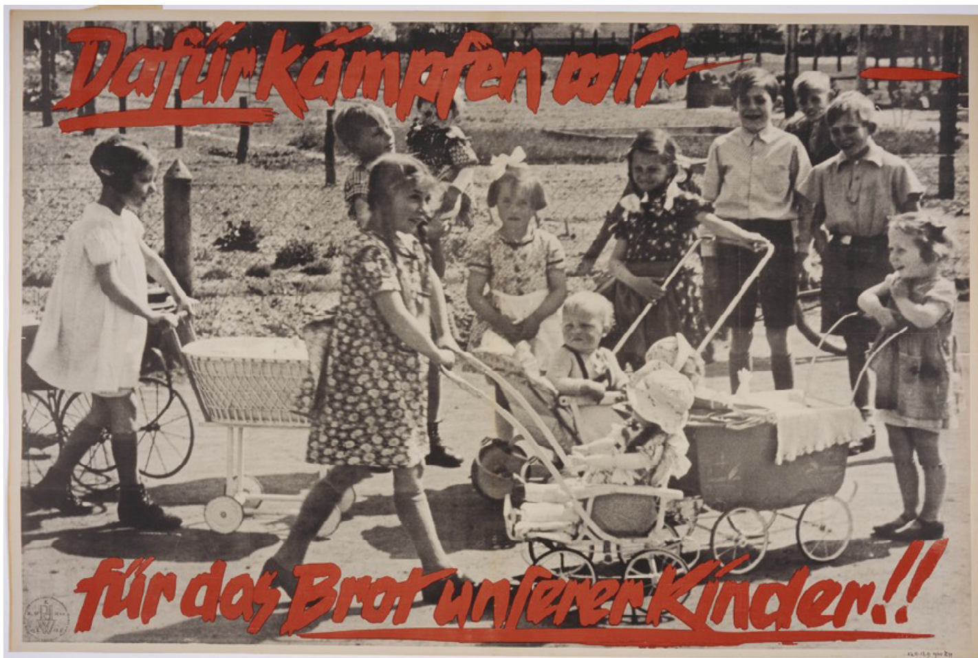
"Why We Fight—for Our Children's Bread! March 11, 1940.