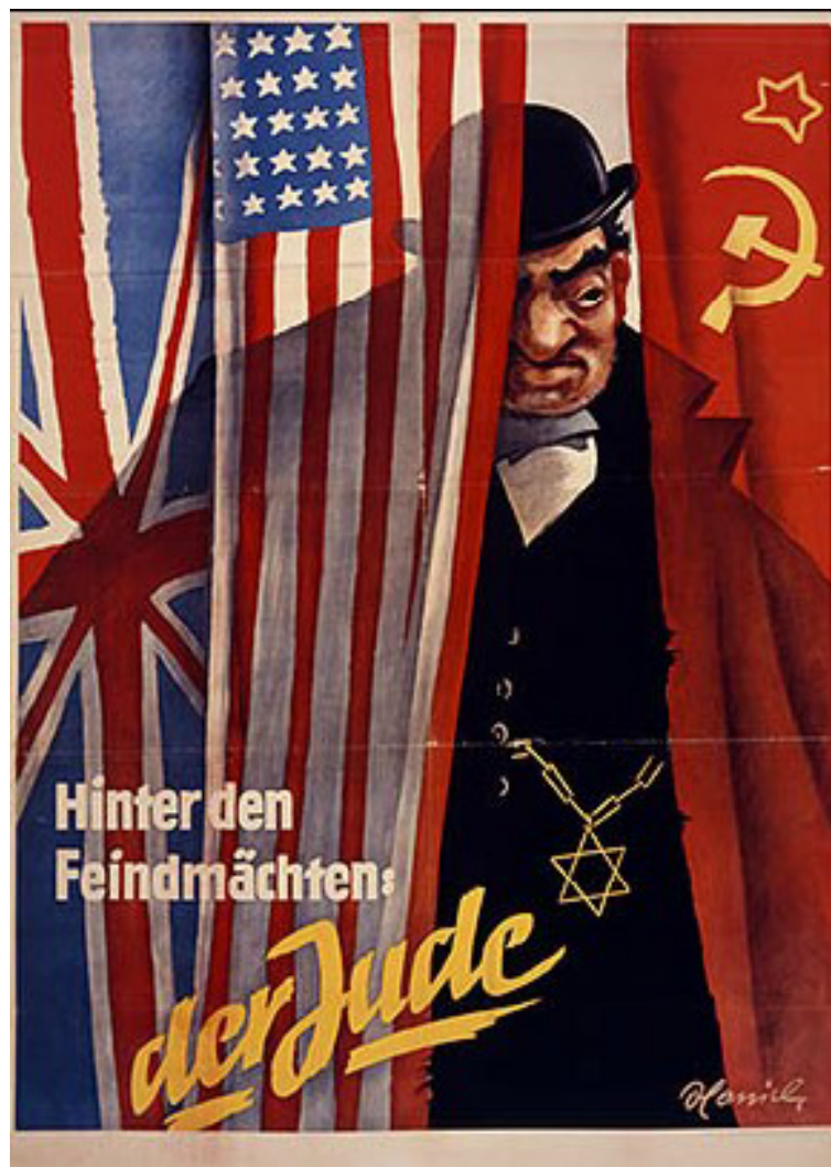
"Behind the Enemy Powers: The Jew." 1942.