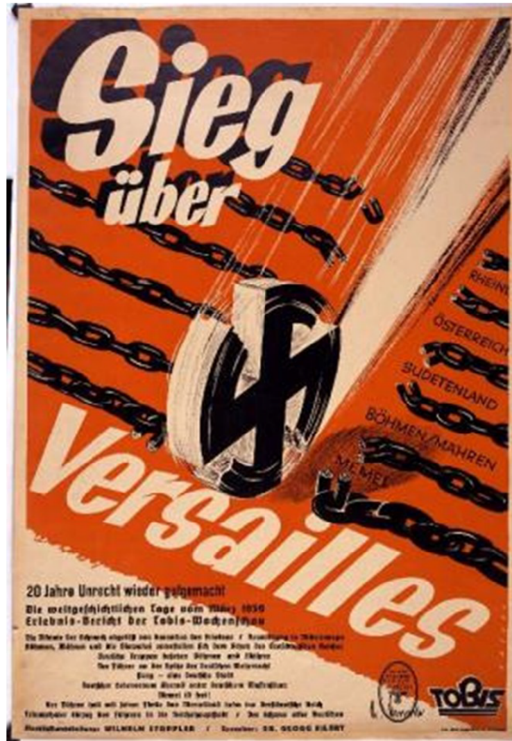
"Victory over Versailles." 1939. Wolfsonian