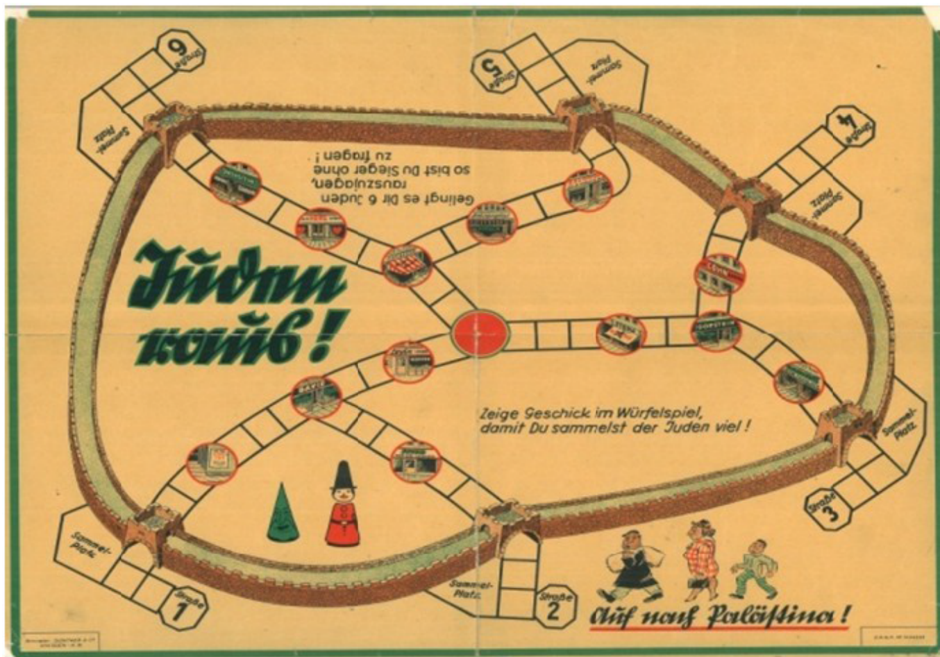
“Jews Out! Show skill in the dice game, so that you collect many Jews! If you succeed in chasing out six Jews, you will be the victor without question! Off to Palestine!” 1938.