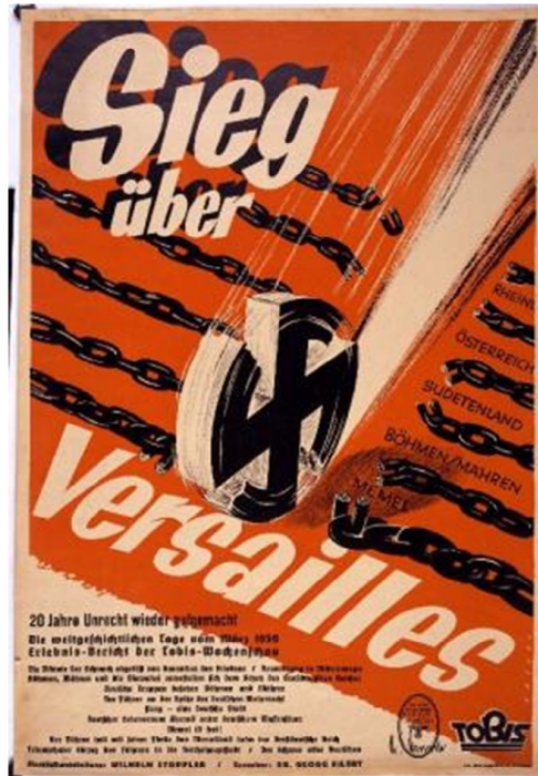
"Victory over Versailles." 1939. Wolfsonian