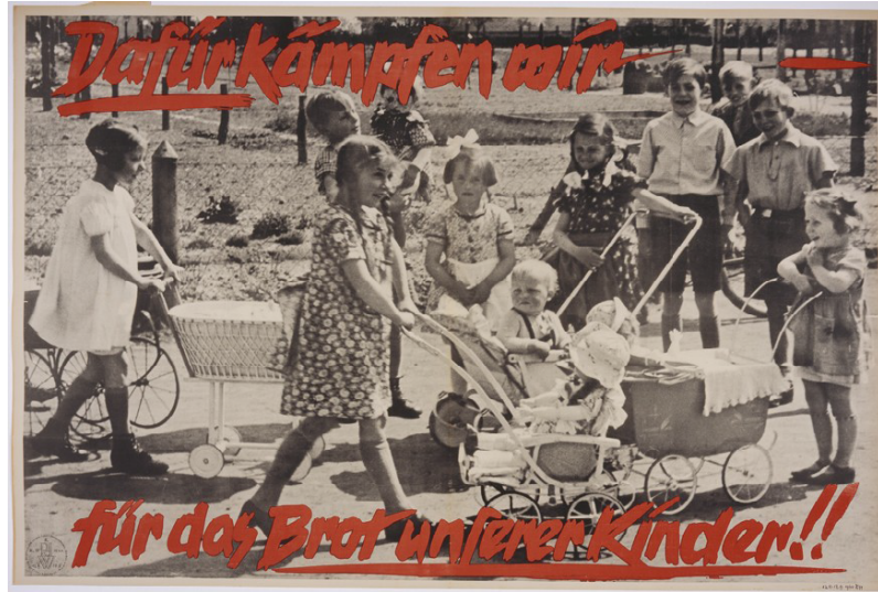
“Why We Fight—for Our Children’s Bread! March 11, 1940.